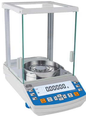
AS 60/220.R2 PLUS Analytical Balance

The drawings, photos and graphics used are for illustrative purposes only.