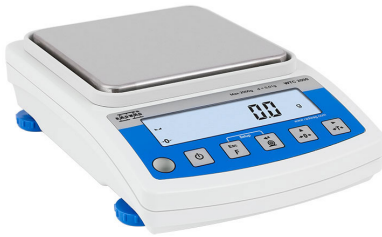
WTC 3000 Precision Balance

The drawings, photos and graphics used are for illustrative purposes only.